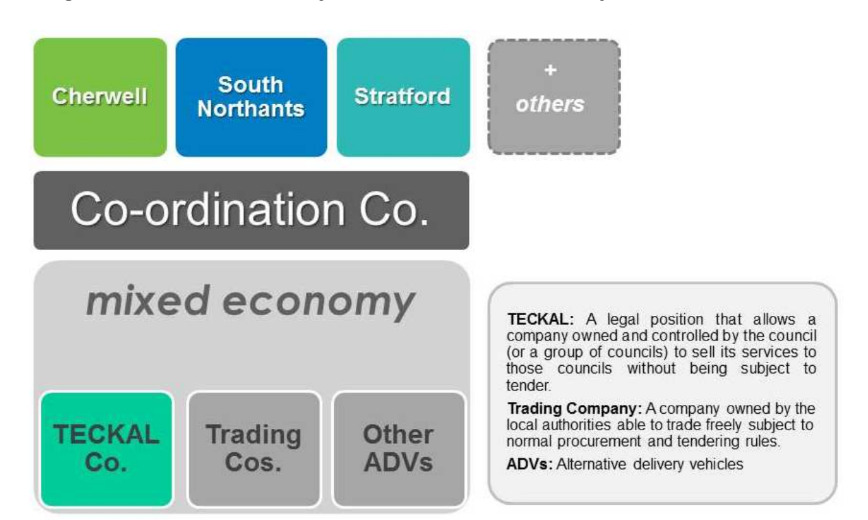
Figure 4: A Mixed Economy Model for Service Delivery