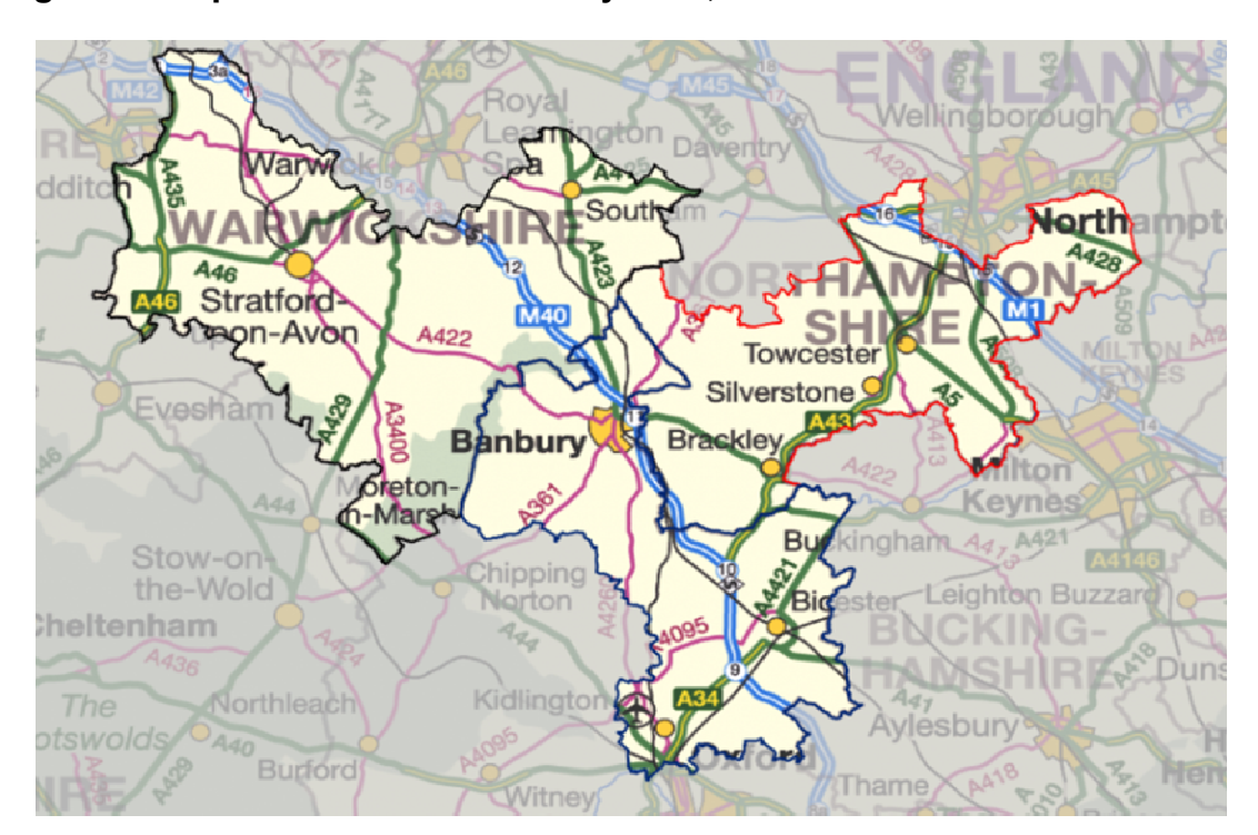
Figure 3: Map of the area covered by CDC, SDC and SNC